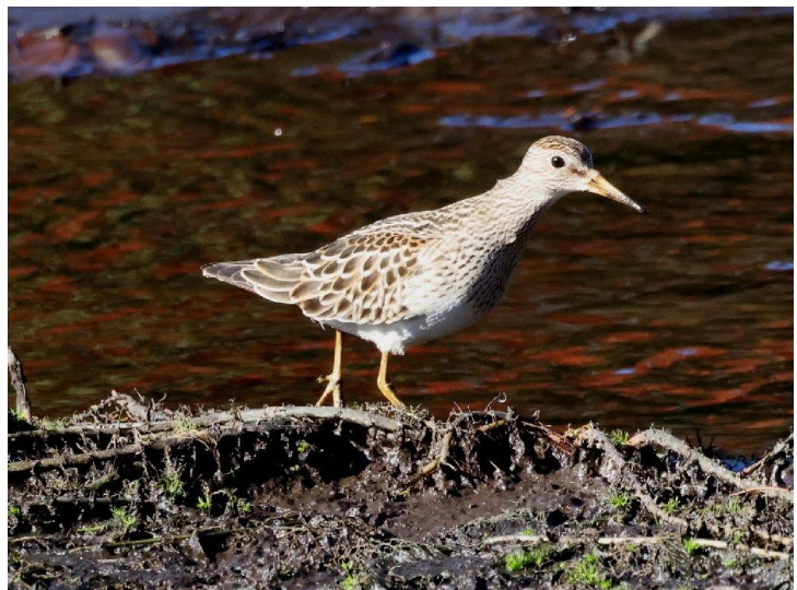
Pectoral Sandpiper Quabbin Reservoir, Hardwick October 27, 2022

https://us02web.zoom.us/webinar/register/WN_0bqM94sbTLmWHNc2iYwgBw