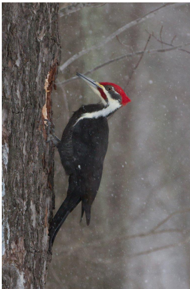
Pileated Woodpecker