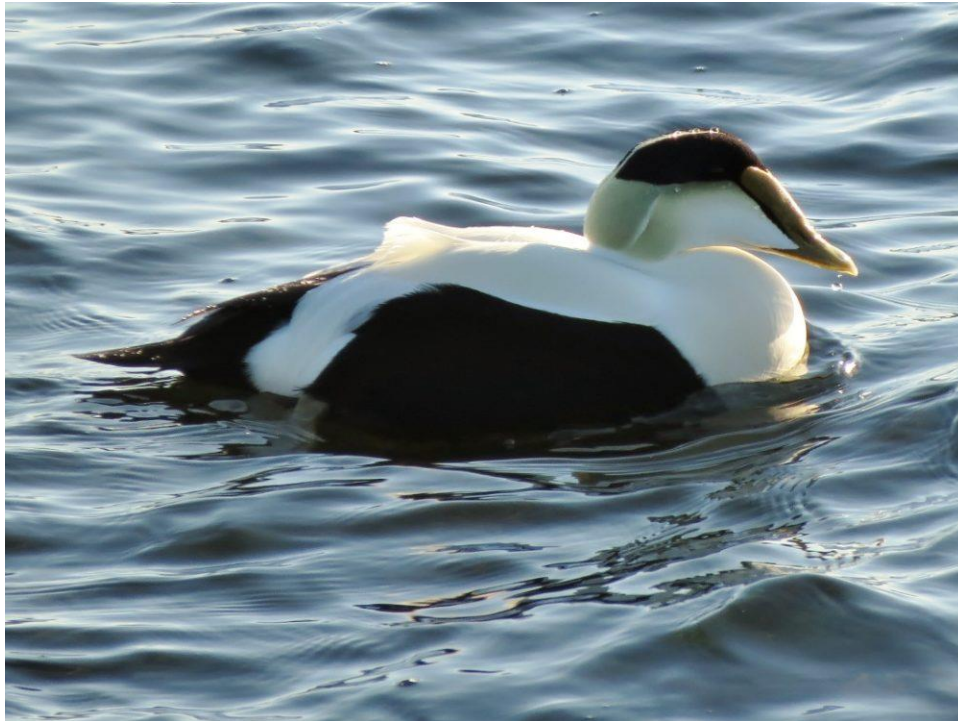
February 24, 2019 Gloucester MA