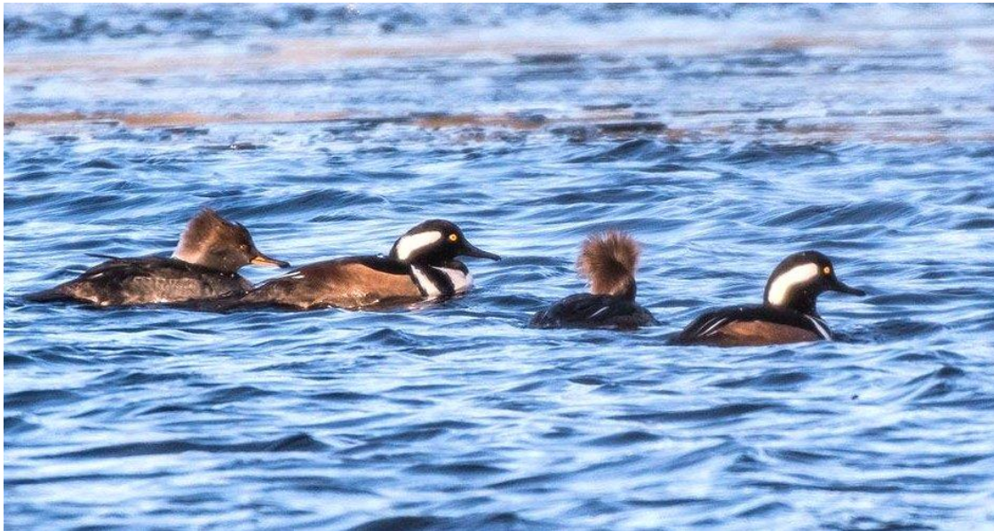
Hooded Mergansers by Bill Platenik

More than 25 species of ducks, geese, loons, and grebes can be found in New England. It may be cold, but winter is the best time to view large numbers of ducks and waterfowl and to appreciate their exquisite plumages. In this online program, you'll be introduced to our local waterbirds, examine similarities and differences between them, and show you the best places to find them. You will learn how useful patterns of contrast can be used to identify both individual birds and distant flocks.