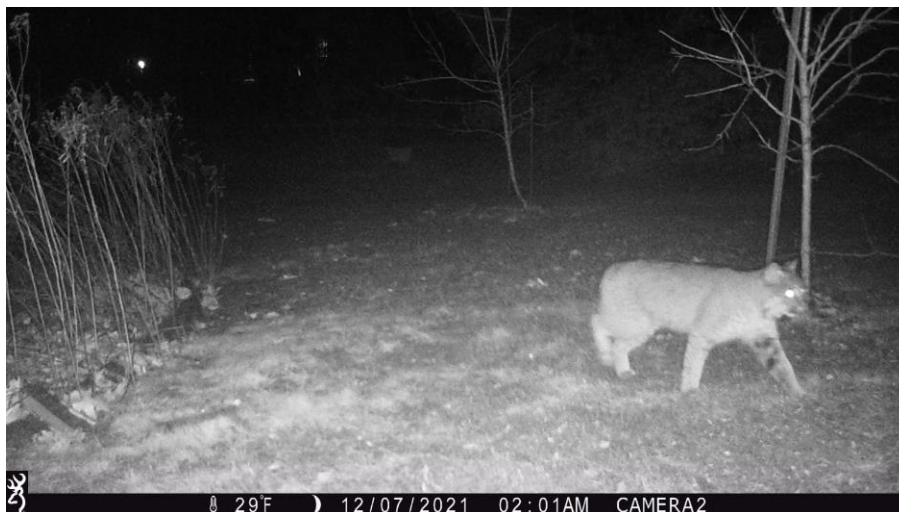
Doug Wipf's Rutland trailcam captures a bobcat on the prowl December 7, 2021

To sign up: warerivernatureclub@yahoo.com