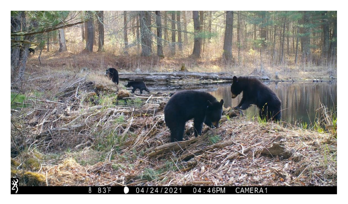
Sow with four yearling cubs (fourth yearling top left)

That sow had four yearling cubs that were captured on video in April in a nearby swamp. This was the first time my cameras had caught some video of a family of five bears with a trail camera, a thrill to say the least!