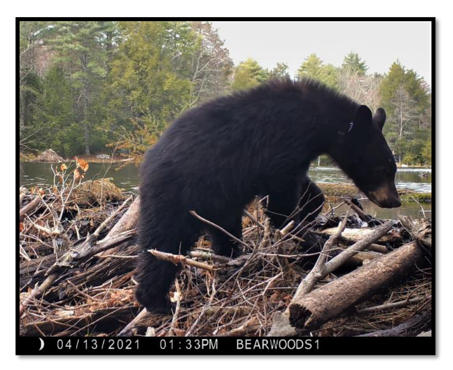
First bear videoed on trail camera April 2021

What I now call "bushwhacking for bears" has helped me learn about the life history of black bears. One day while following a stream, I stumbled upon a bear babysitting tree. How did I know that? Well, I didn't at first. But finding seventeen piles of bear scat in an area 20' x20' got my attention. Why would bears keep dropping scat in this one spot? The answer stood right in the middle of the scat piles. A mature hemlock tree with lots of thick branches, claw marks and wear on the trunk told the story. The sow would send her cubs up the tree while she foraged the forest.