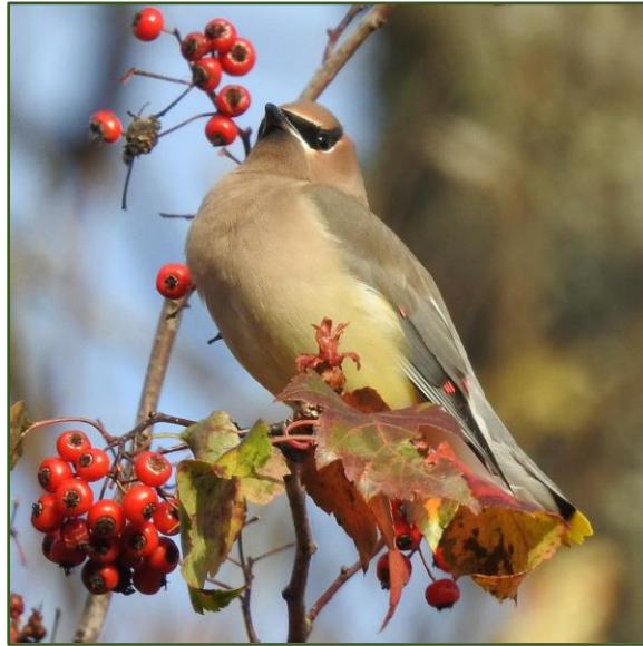
Cedar Waxwing, Rutland, November 2, 2021