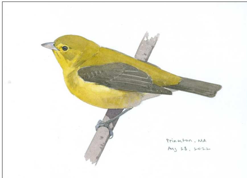
Immature Scarlet Tanager