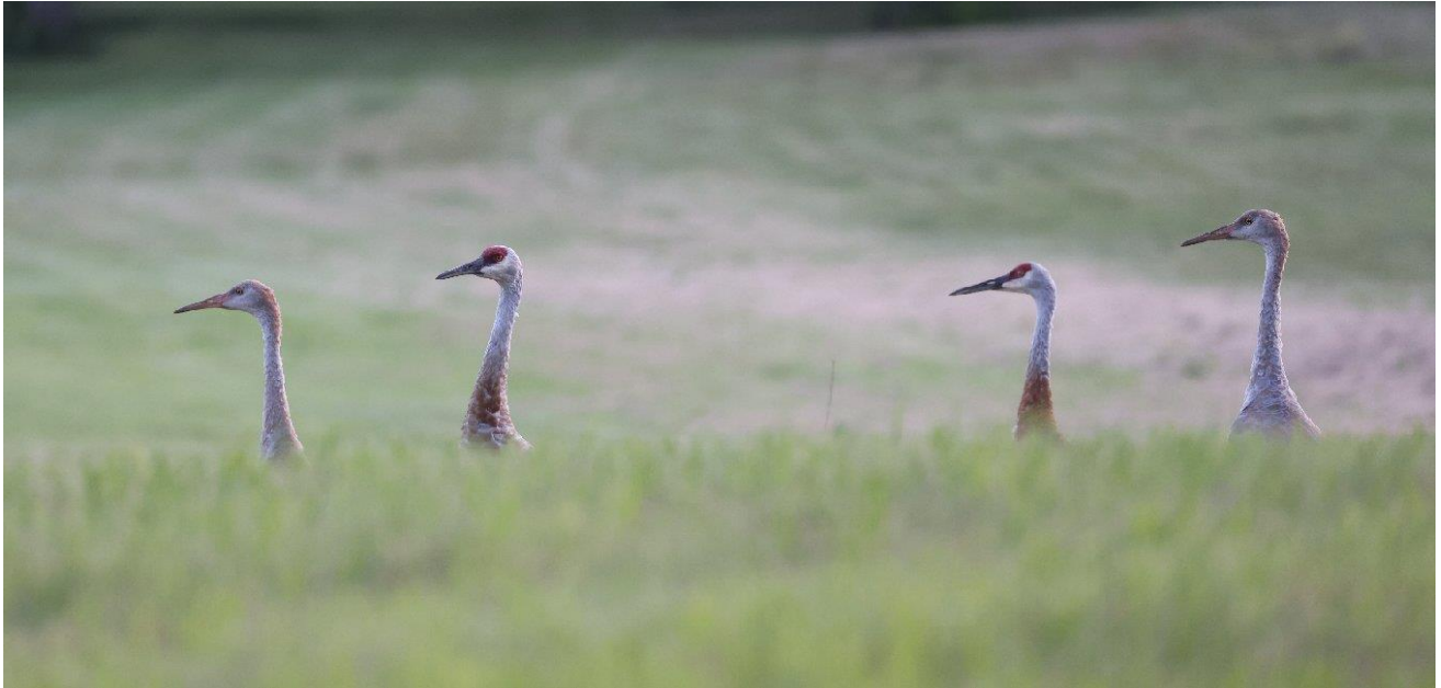
Sandhill Crane family in Hardwick September 3, 2022