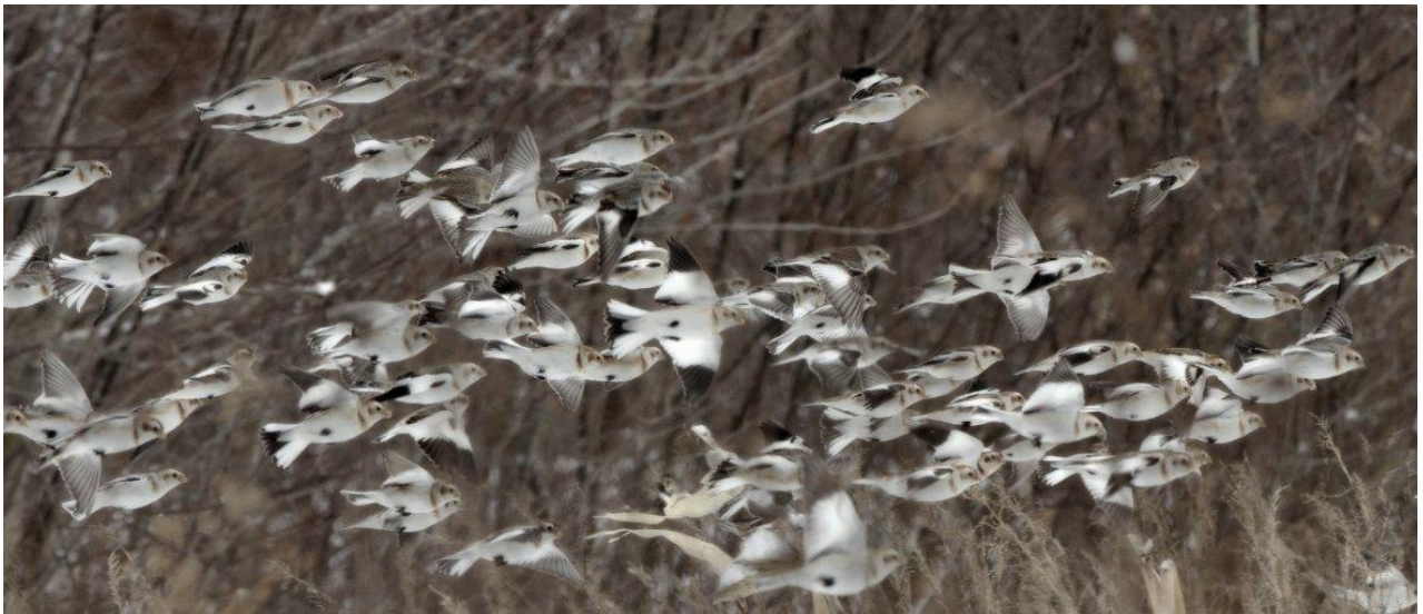
Snow Buntings

If you wish, you may post a comment by clicking on the title of any post.