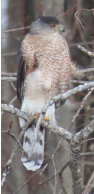
Cooper's Hawk